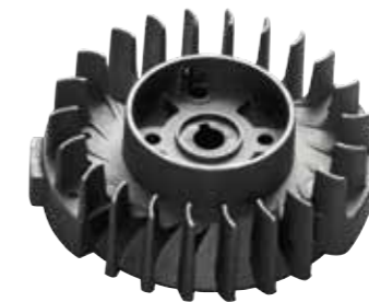
TURBINE WHEEL FOR WATER PUMP