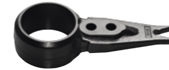
ENGINE MOUNT, RENAULT