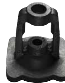
BONNET FOR GLOBE VALVES