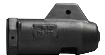
CAP FOR SAFETY VALVES