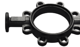
BODY FOR BUTTERFLY VALVES