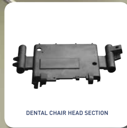
DENTAL CHAIR HEAD SECTION