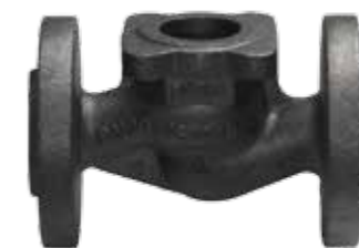
BODY FOR GLOBE VALVES