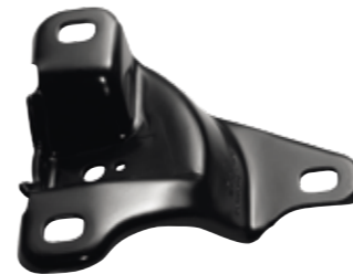
ENGINE BRACKET, FORD