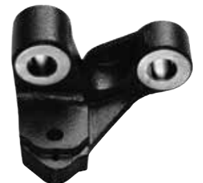
TORQUE BRACKET, OPEL