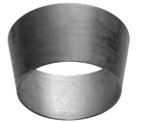
COMPONENT FOR REAR AXLE ANTI-VIBRATION, VOLVO TRUCK