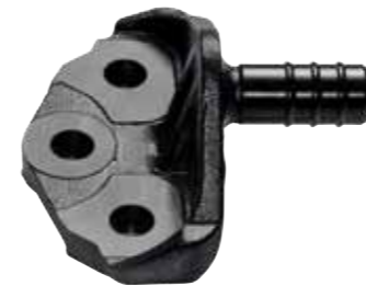
ENGINE BRACKET, OPEL