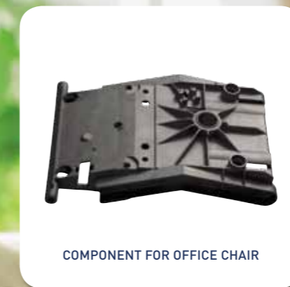
COMPONENT FOR OFFICE CHAIR