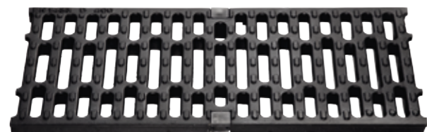
CAST IRON GRATING